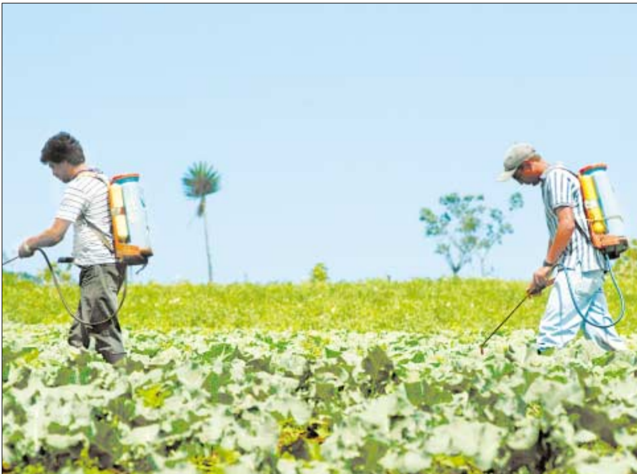
UNPROTECTED: Farm workers in rural Paraíso de Cartago, east of San José, spray crops with Lannate – a pesticide deemed “highly dangerous” by the Agriculture Ministry – without wearing safety masks or gloves.