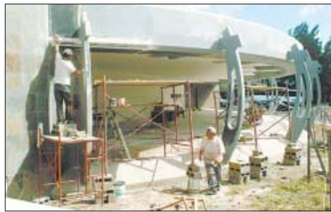
GOOD year: The Construction Chamber predicts this year will be even better than 2003, which it called “a record year for construction.”

According to the chamber’s report, most new investments in construction last year (58%) were in housing, which grew 25% and totaled 1,595,487 square meters. Four (Page 5)